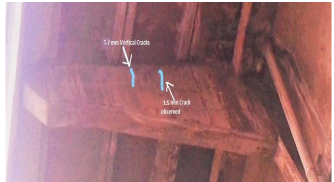
Figure 7 Crack observed in the beam supported slab

In the Figure 7 the cracks forms due to the Excess Loading and Aging can be easily seen. The several crack which is exceeding the standard limit can be easily observed.