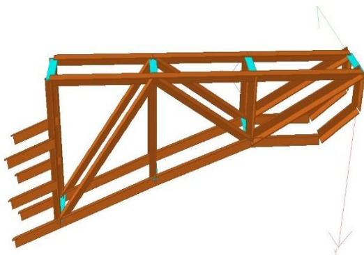
Figure 9: Model of Cantilever Steel jacket

Table 2 contains the material properties which was uses in the designing and retrofitting of footbridge.