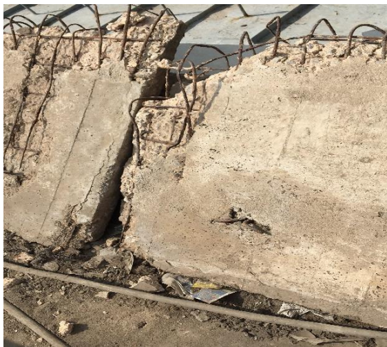
Figure 5 Scrapped portion of deck Slab