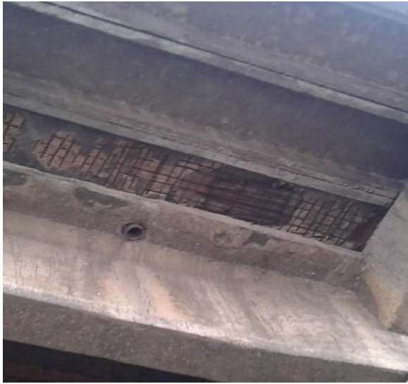
Figure 3 Bottom View of footbridge slab