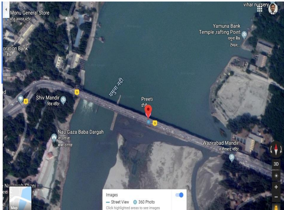
Figure 1 Geographic layout of Yamuna Bridge

* IS 3025 Part17 [5] and IS 456: 2000 [15].