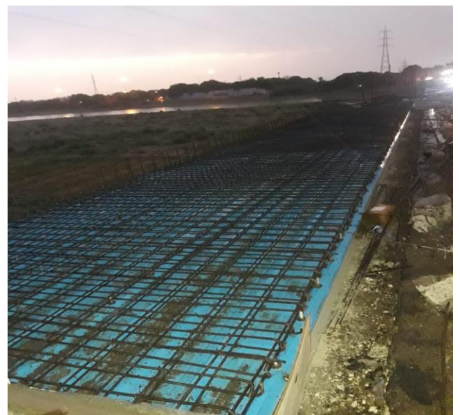
Figure 11 Skelton of steel for Deck slab