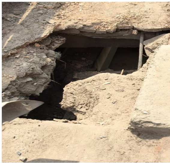
Figure 4 Top View of Slab