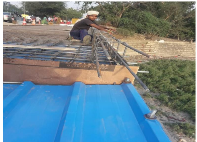
Figure 10 Laying of PPGI sheets

As specified in table 2, PPGI sheet were drawn below the deck slab to protect the Deck slab from the corrosion and deterioration from dangerous chemical in below flowing river Figure 10 and Figure 11. The sectional line diagram of deck slab can be observed in Figure 12.