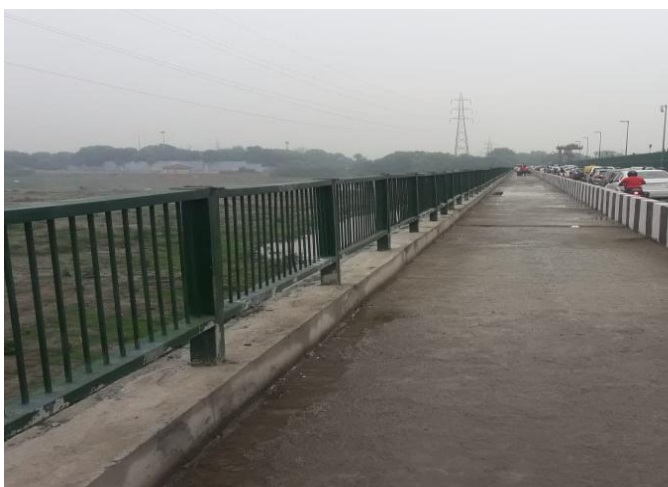
Figure 14 Final View of Retrofitted foot bridge Slab