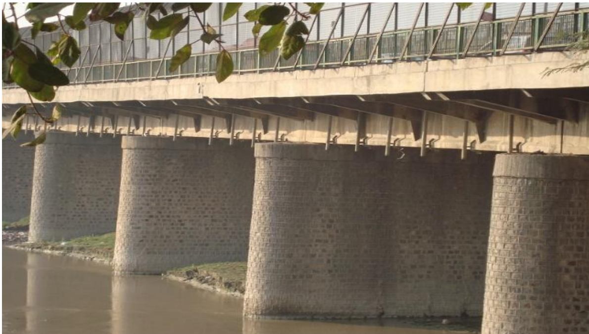
Figure 2 Global Image of Yamuna Bridge

The 23 span Bridge consisting 22 concrete piers and 2 abutments. The total length of bridge is 460 meters and total width of footbridge is 3.0 meter. It is supported on cantilever is situ cast beam. Figure 2 Present a global view of footbridge portion supported on cantilever beam. The Bridge has 2.5% Longitudinal and 0.75% of traverse slope.