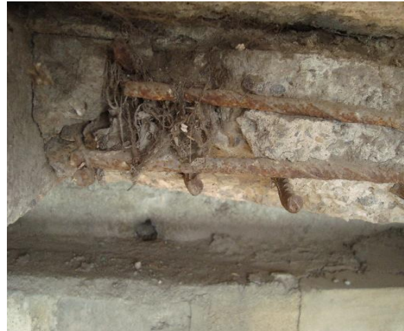
Figure 6 Deteriorated Reinforcement of slab

In the Figure 7 the cracks forms due to the Excess Loading and Aging can be easily seen. The several crack which is exceeding the standard limit can be easily observed.