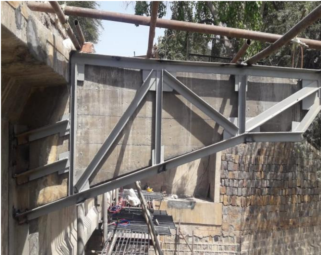
Figure 8. Jacketing of Cantilever beam of footbridge