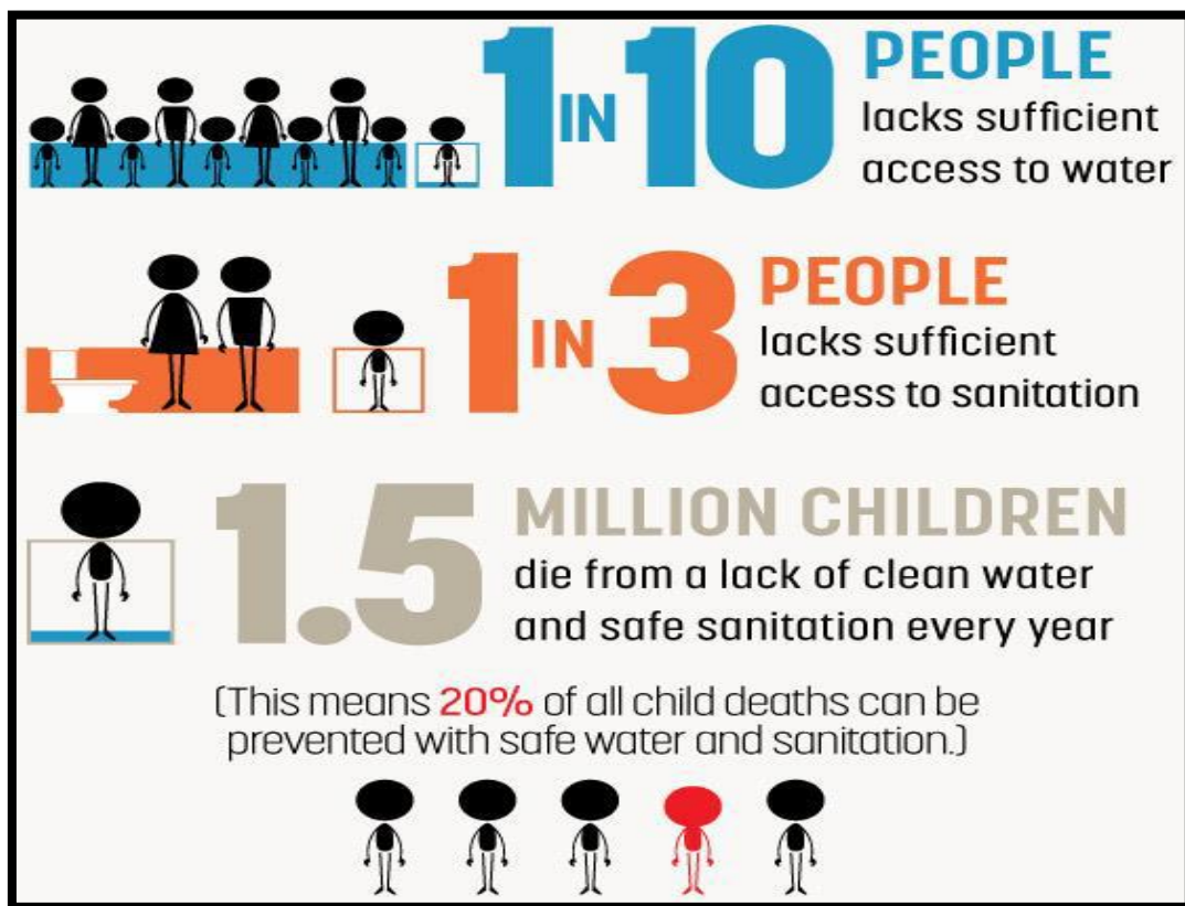
Fig. 1.1 An immediate action need to be taken to find a solution for water shortage globally ( www.unwater.org )

climate change, which brings uncertainty towards the available freshwater, and due to this uncertainty, the solar distillation can be utilized to obtain drinking water from saline, which is abundantly available in sea. The contaminated water includes bacteria, harmful chemicals, dissolved and undissolved municipal waste, which causes a severe threat to one's health while drinking the same. The UNICEF (United Nations International Children's Fund) and WHO (World Health Organisation) presented a report in 2015 (Fig. 1.1) which stated that nearly 663 million people have no access to safe drinking water and depend upon polluted springs, wells, and surface water (2015).