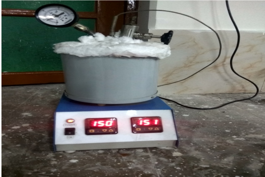
Figure A1 Set up for thermal and thermo-chemical treatment of OFMSW